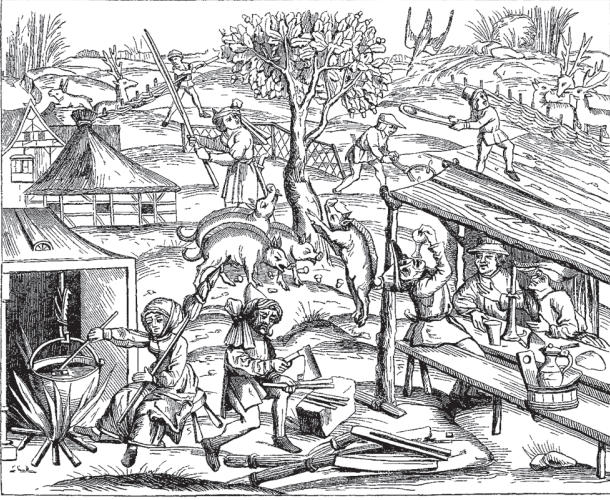
COUNTRY LIFE - Facsimile of a woodcut in a Folio Edition of Virgil. Pub. 1517

You can see that our food choices are rich and varied. Our cooks are talented and creative, and we heartily enjoy what we eat!